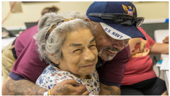
FEMA staffer helping a survivor in Refugio, TX.

If you need legal assistance due to Harvey, call the Young Lawyers Division of The American Bar Association at 800-504-7030. Survivors can receive free counseling on insurance claims, landlord- tenant issues, home repair contracts, foreclosures, replacement of legal documents destroyed or damaged by the storm and other legal matters.